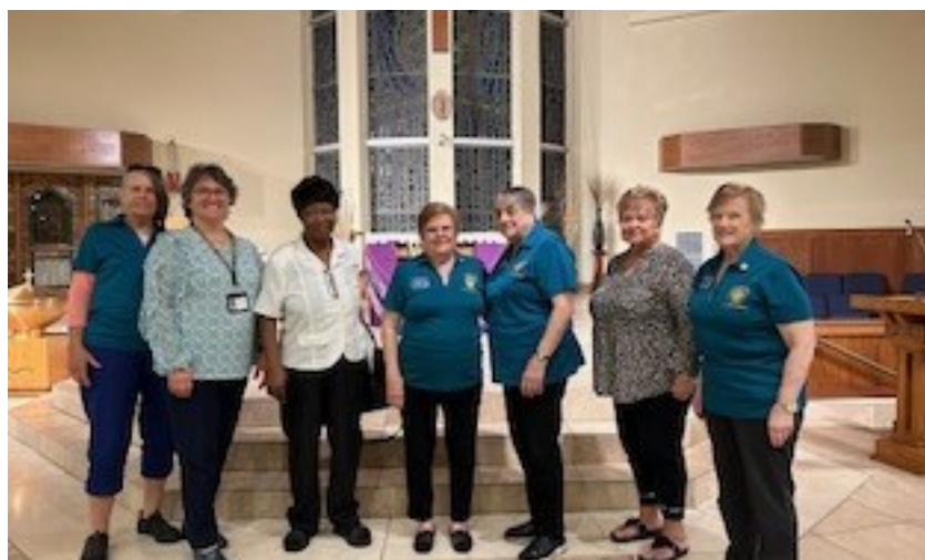
Columbiette at the Stations of the Cross at Holy Redeemer Church